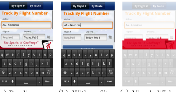
(a) Baseline execu- (b) With exfiltra- (c) Visual diff betion tion blocking tween (a) and (b)

Detecting whether side effects impact user-desired functionality is a determination that eventually requires consultation of a user. However, placing a human in the loop can introduce bias and slow the process down, running counter to our goal of systematic, automated testing. To reduce the scalability constraints and bias caused by human evaluation, we leverage the insight that side effects are likely easy to detect and confirm if the visual outputs of the baseline and experimental executions can be compared side by side. We employed a feature of the GUI testing system to capture a screenshot from the Android device after every command in the test script. We first ran each test script with our baseline configuration—no resources were replaced with shadow resources and no attempts to exfiltrate data were blocked. We then ran each test script with our experimental configurations, in which either data shadowing or exfiltration blocking was activated. For each experimental execution, we automatically generated a web page with side-by-side screenshots from the baseline execution and the experimental execution, along with a visual diff of the two images. We found that these outputs could be scanned quickly and reliably, with little ambiguity as to whether a side effect had been captured in the image logs, as shown in Figure 3.